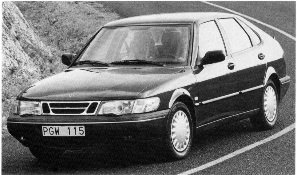
The long awaited SAAB 900 will be in dealers' showrooms soon.

A technical breakthrough is the availability of an optional automatic clutch system, replacing the clutch pedal with an electronically controlled operating module that takes most of the physical effort out of shifting. This feature will first be offered on the 2.0