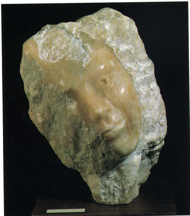
Alabaster Face by Sjödin